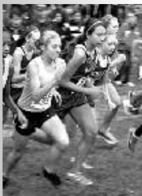
Cross Country sent their entire team to the Class 2A Sectional this year