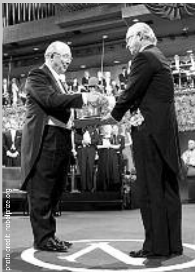
Dr. Mortensen receiving his Prize from His Majesty King Carl XVI Gustaf of Sweden at the Stockholm Concert Hall, December 10, 2010