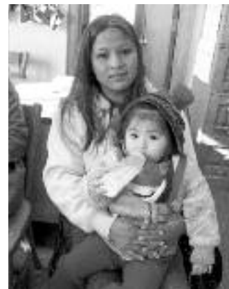
481 items were donated to the Dominican Literacy Center from the Cozy Christmas Collection