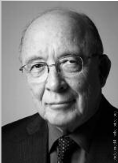
Dr. Dale Mortensen, 2010 Nobel Prize Winner, Economic Sciences